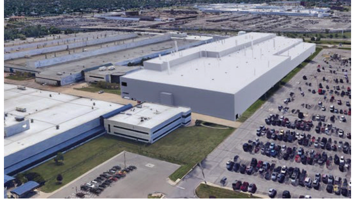
Conceptual renderings of FCA expansion at Jefferson North Assembly Plant.

Chrysler has announced a $5.4 billion expansion to their Jefferson North Assembly plant in Detroit. The plant expansion is expected to more than double rail traffic from the facility. The expansion tentatively includes installation of a vehicle tunnel under the Terminal East I.T. to move finished vehicles from the plant to the loading area and building a pedestrian bridge from a new parking area to the plants. Conrail is also currently engaged in talks with the City of Detroit on a 7 acre land sale to consolidate parcels on the east side of the plant. Good communication has been essential to the planning and execution of Chrysler's needs from multiple groups in Conrail including; Detroit Transportation, Engineering, Real Estate, and Legal.